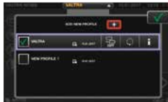
Profiles for operators and implements which can be easily changed from any screen menu. All the setting changes will be saved in the selected profile.