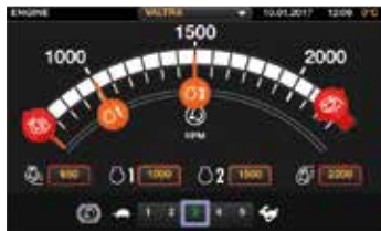
The settings are logical and easy to set up with swipe gestures. All settings are automatically stored in the memory.