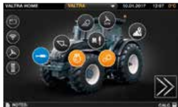
Easy to navigate menu structure.