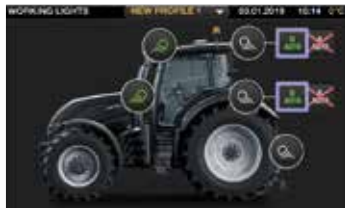
It's easy to configure the work lights using the 9" touchscreen. There are also on/off buttons for the work lights and beacon in the armrest.