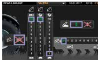
The 9" touchscreen, large controls, settings and functions are easy to understand.