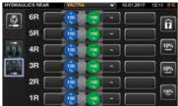
You can assign any control to operate any hydraulic function, including front and rear hydraulic valves, front and rear linkages and the front loader.